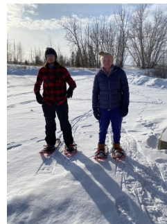
Phys Ed 10 - enjoying the great Outdoors