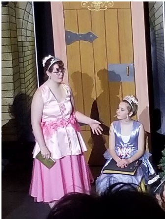
Sharing their talents with the community