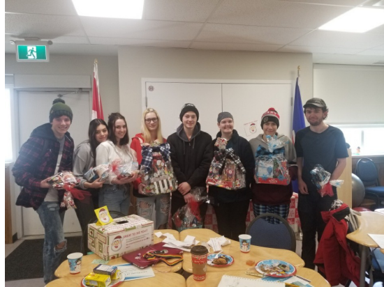
Winners of our December Attendance Baskets