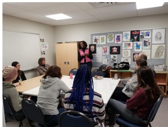
Victim Services Presentation