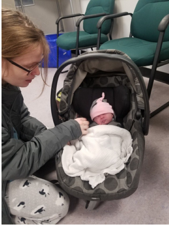
New member of our CLC family